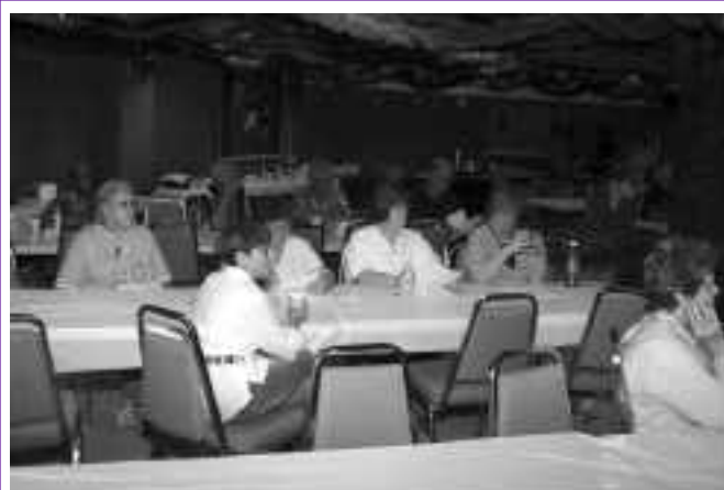
RMC Members listen to reports by the RMC Executive Board at the September meeting.

Our next meeting will be on Wednesday, October 12th at 11:00am in the basement of 4301 Garden City Drive in Landover, MD. We hope to see many of you there.