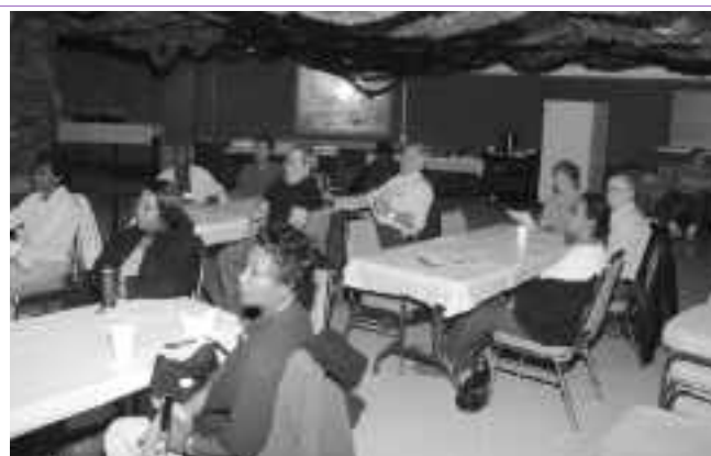
Members listen to Executive Board reports at the April RMC 2108 Membership meeting.

Money for the Atlantic City trip (May 18th) needs to be in by May 7, 2005. Make checks payable to RMC2108 and send them to the Local. If you are paying for more than one person, please include names of those you are paying for. This will be a fun trip so plan on joining us.